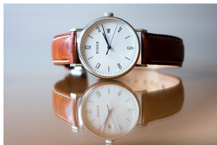
Does Cutting up a Work of Art and Re-using Fragments of the Canvas to Make Watches